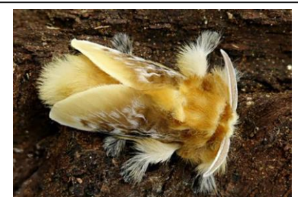
Male Southern Flannel moth (dorsal view) Megalopyge opercularis

Don't forget to visit our website: www.floridastateparks.org/delnorwiggins and the Friends of Delnor-Wiggins Pass State Park website: www.delnorwiggins.org Like us on Facebook at: www.facebook.com/friends.delnorwiggins