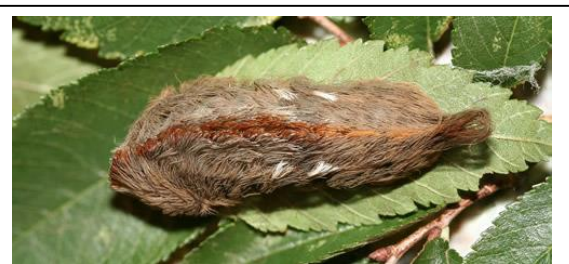
Puss caterpillar (dorsal view) Megalopyge opercularis

Did you know that over 50 species of caterpillars can sting? Caterpillars, the larval forms of moths and butterflies, often have stinging fibers and hairs as a form of protection against predators. One example is the Puss caterpillar (larval form of the Southern Flannel moth). The Puss caterpillar is one of the most venomous caterpillars in the United States. A slight brush or sting from a caterpillar can be very painful but for most people not a serious injury. However, people with any allergy problems should pay careful attention to their reactions. To learn more about the Puss caterpillar and Southern Flannel moth click here. To learn how to treat a caterpillar sting click here.